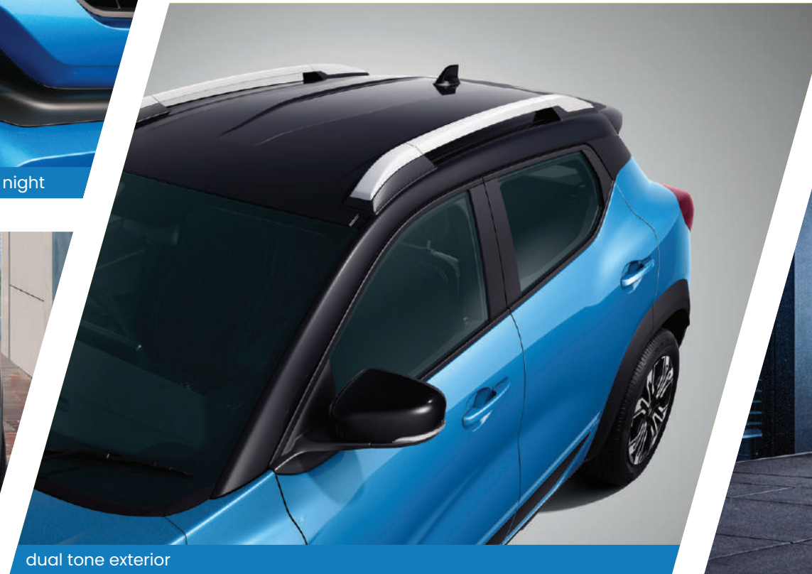
dual tone exterior

As you drive into the unexpected, stand out with the KIGER's eye-catching dual tone exterior. The car's sculpted design, tri-octa pure vision LED headlamps with LED DRLs day & night and C-shaped signature LED tail lamps are built to stand out. These are enhanced by the chrome front grille, sporty rear spoiler, shark fin antenna and functional roof bars that have you looking great while you go from one experience to another. The KIGER's 40.64 cm Diamond Cut alloys, rear skid plate and high ground clearance of 205 mm add to its imposing stance.