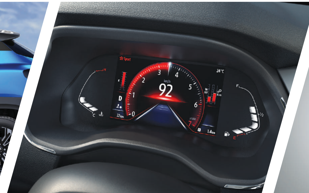
multi-skin 17.78 cm reconfigurable TFT cluster