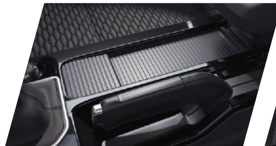
high centre console with 7.5L storage