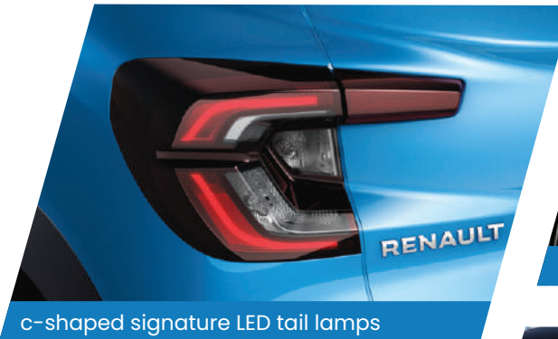
c-shaped signature LED tail lamps