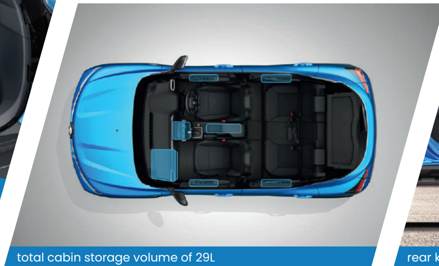
total cabin storage volume of 29L