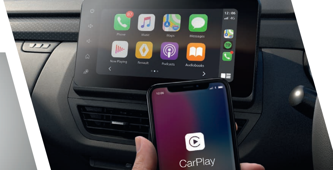
20.32 cm display link floating touchscreen with wireless smartphone replication