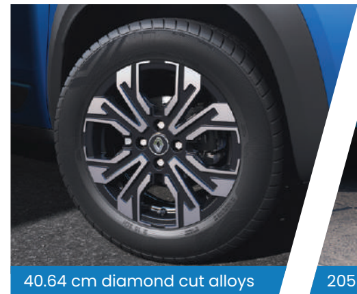
40.64 cm diamond cut alloys