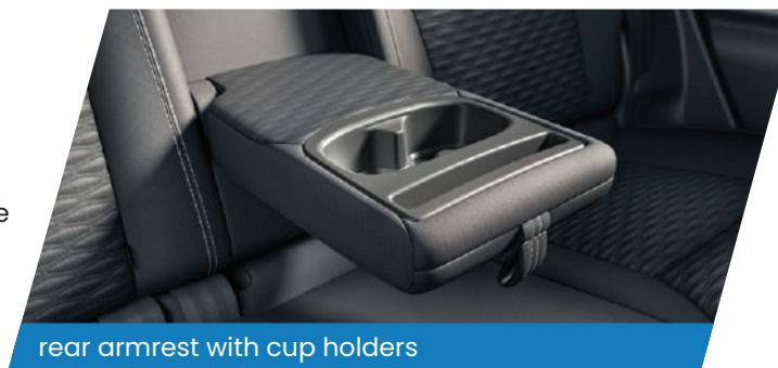
rear armrest with cup holders

The Renault KIGER's high cabin storage volume has you ready for the new, when you hit the road with your group. Get space for all your belongings with the 405L cargo space that can be enhanced to 879L by folding rear seats. There's also additional storage space of 14.9L in upper and lower glove boxes and 7.5L in the centre console storage compartment. The KIGER's rear row comes with a knee room of 222 mm, a flat floor and elbow width of 1431 mm to help comfortably seat three.