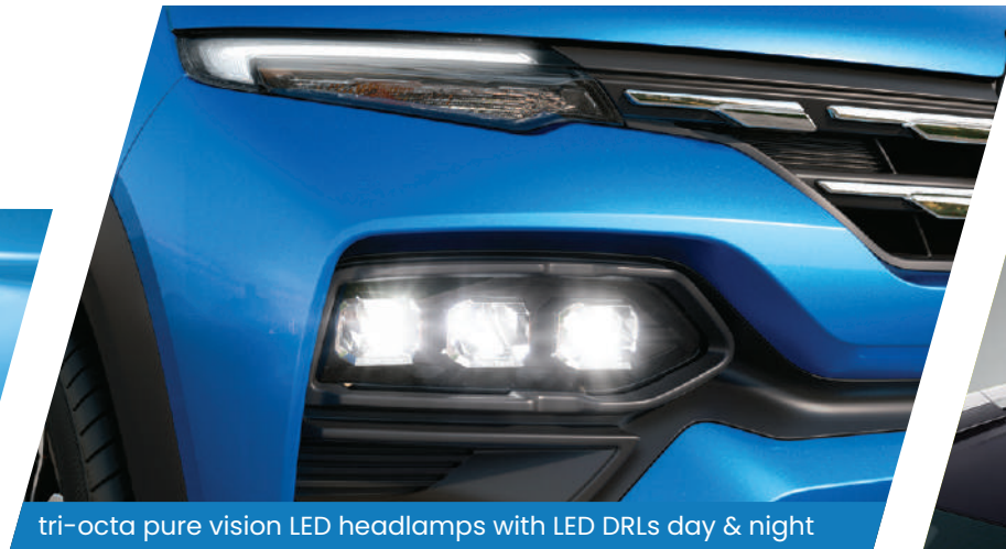
tri-octa pure vision LED headlamps with LED DRLs day & night