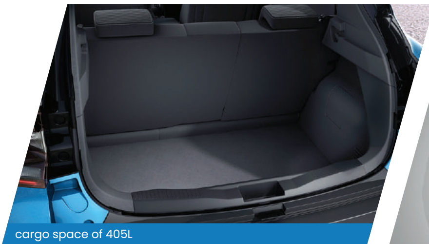
cargo space of 405L