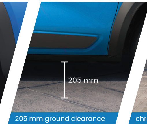
205 mm ground clearance