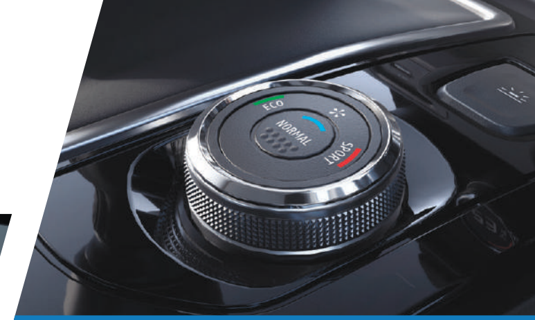
multi-sense drive modes