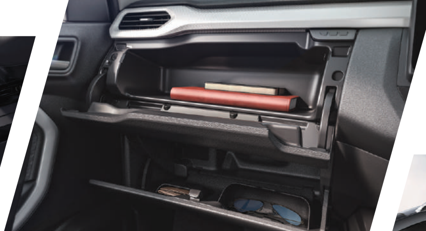
glove boxes volume of 14.9L