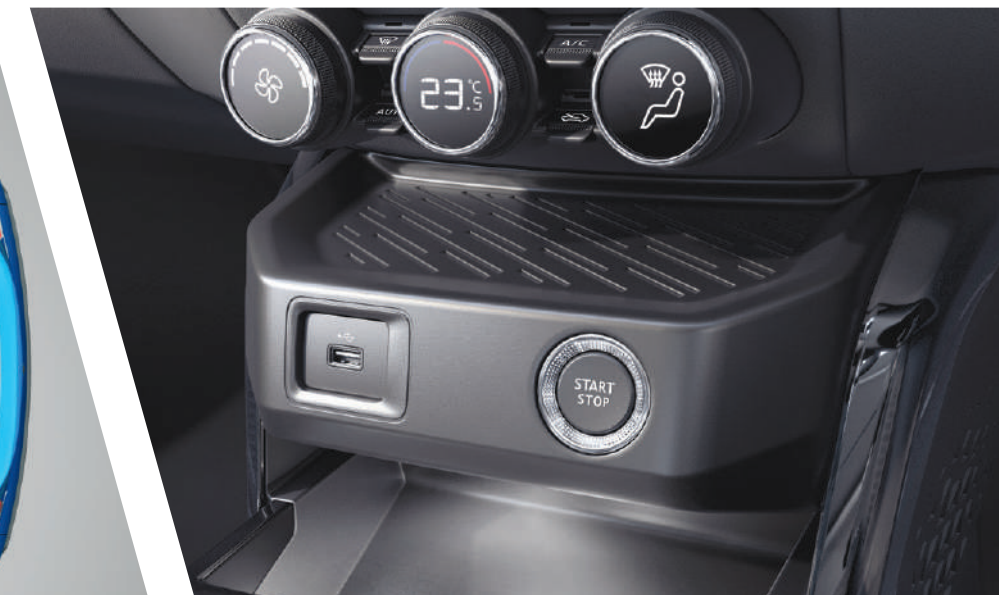
auto AC with pm2.5 clean air filter