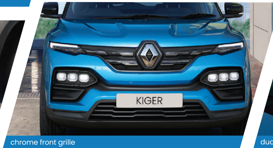
chrome front grille