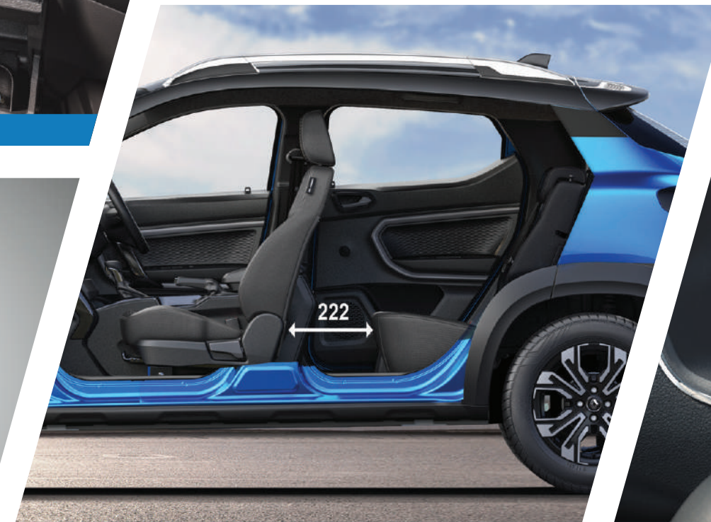
rear knee room of 222 mm