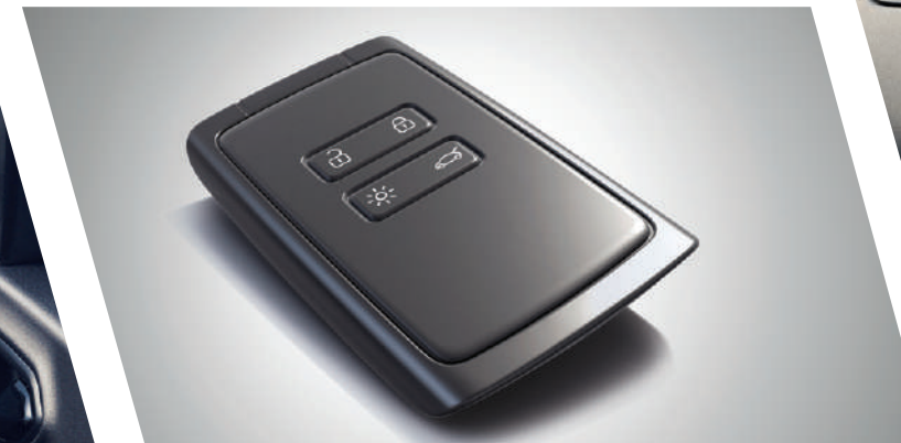
smart access card

The Renault KIGER's smart interiors are designed to make every trip memorable. It features Android Auto/Apple CarPlay with wireless smartphone replication and 3D sound by ARKAMYS® for an exciting in-car entertainment experience. Smart technology inside continues in Push Start/Stop, Smart Access Card, rear view camera and Auto AC.