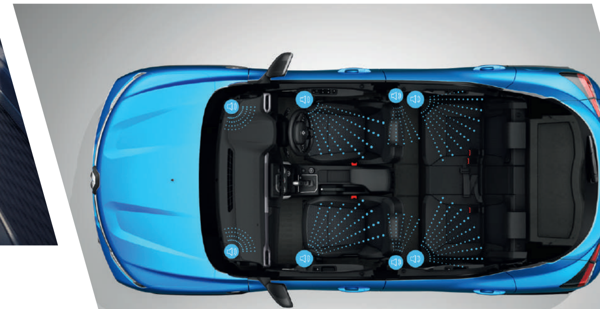
3D sound by ARKAMYS® (4 speakers + 4 tweeters)