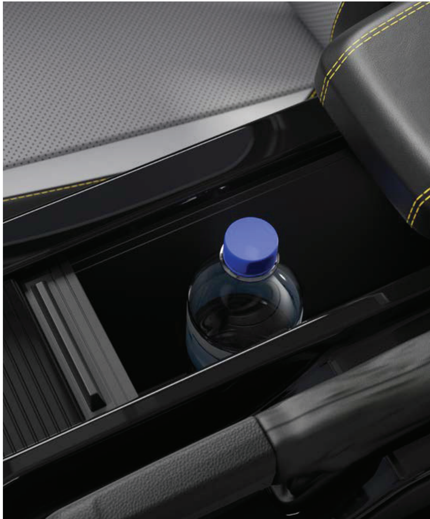
high centre console with storage