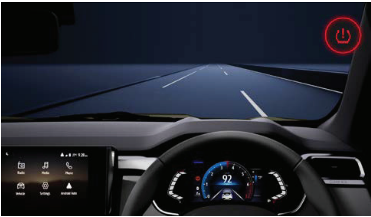
tyre pressure monitoring system Displays the tire pressure status in real-time.