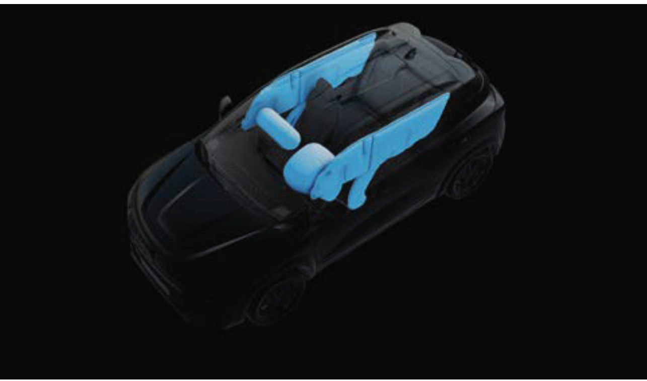
6 airbags Six airbags offer increased protection.