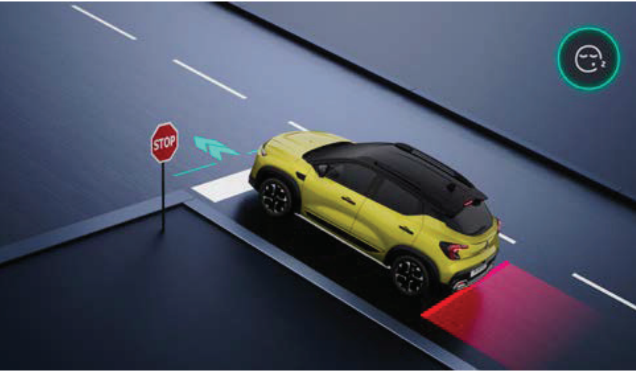
hill start assist Maintains brake pressure for two seconds, preventing rollback when you move away on a steep slope.