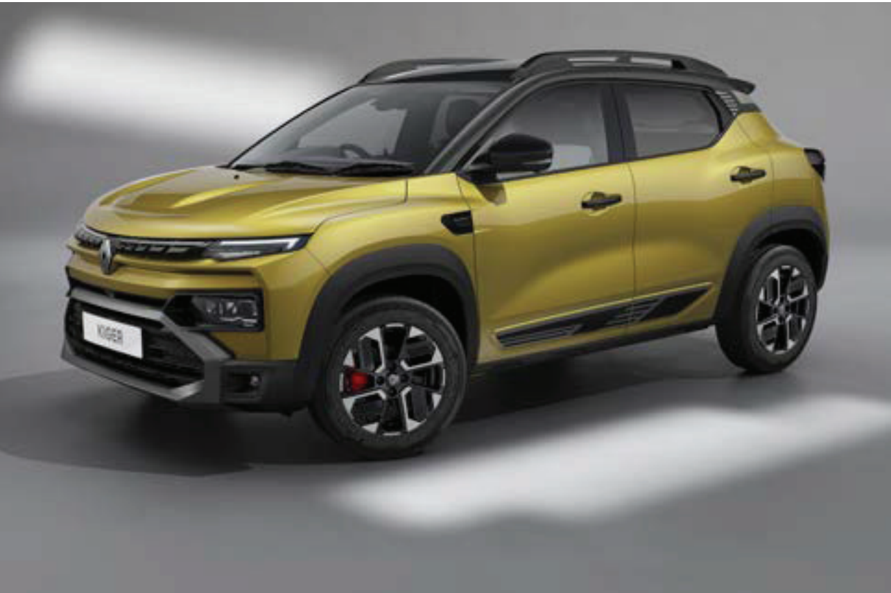
new oasis yellow with mystery black roof