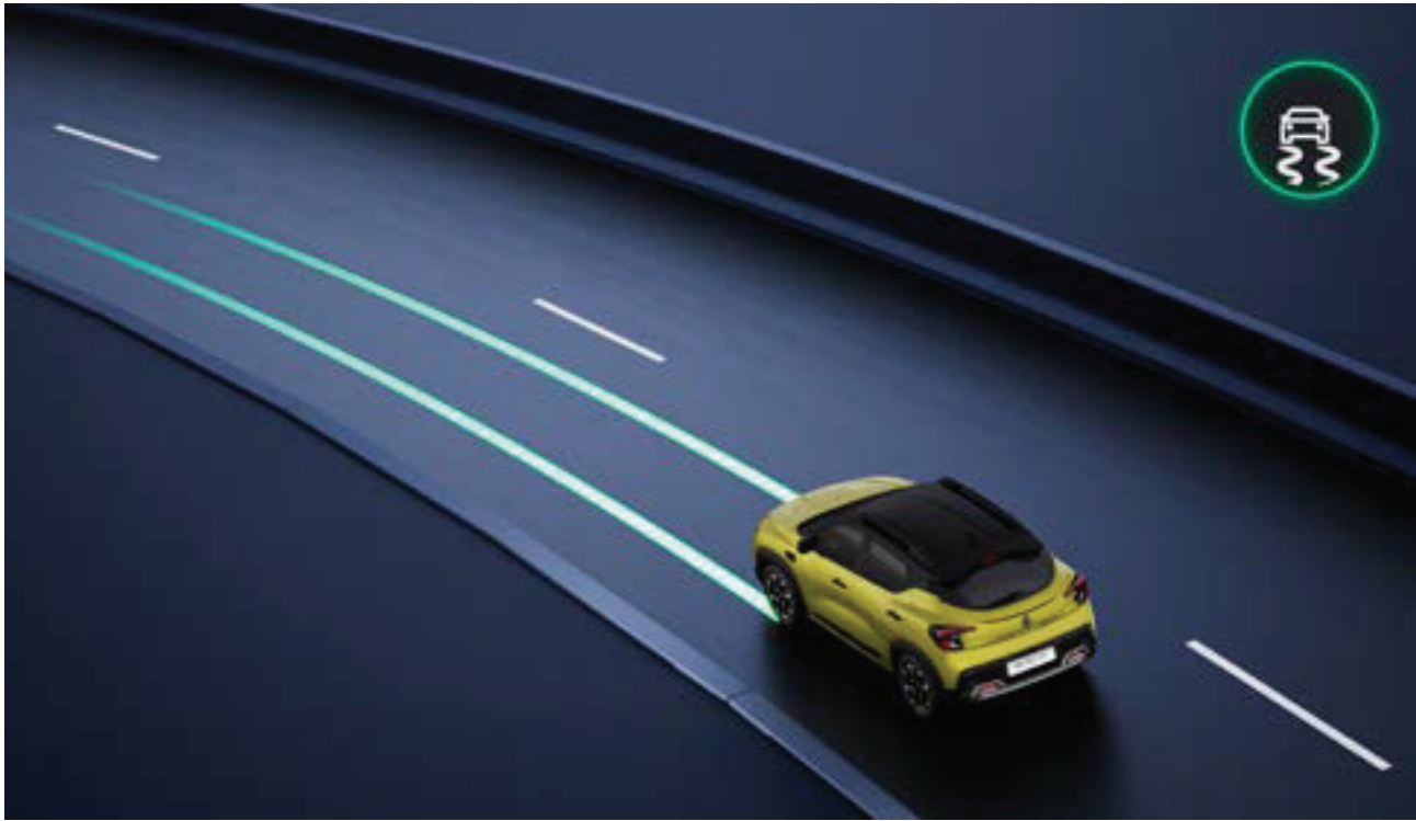
electronic stability program Automatically corrects your car's trajectory so you avoid dangerous skids.