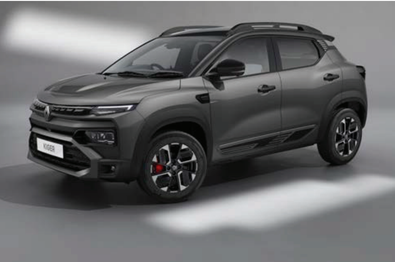
new shadow grey with mystery black roof