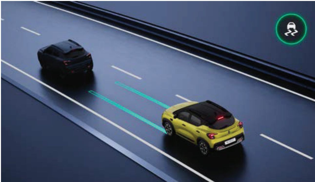
anti-block braking system (ABS) and EBD with brake assist Optimizes braking force distribution to each wheel, enhancing vehicle stability and control during braking, particularly in emergency situations. It works by ensuring that the appropriate amount of braking force is applied to each wheel based on its load and traction, preventing wheels from locking up and potentially causing a skid.