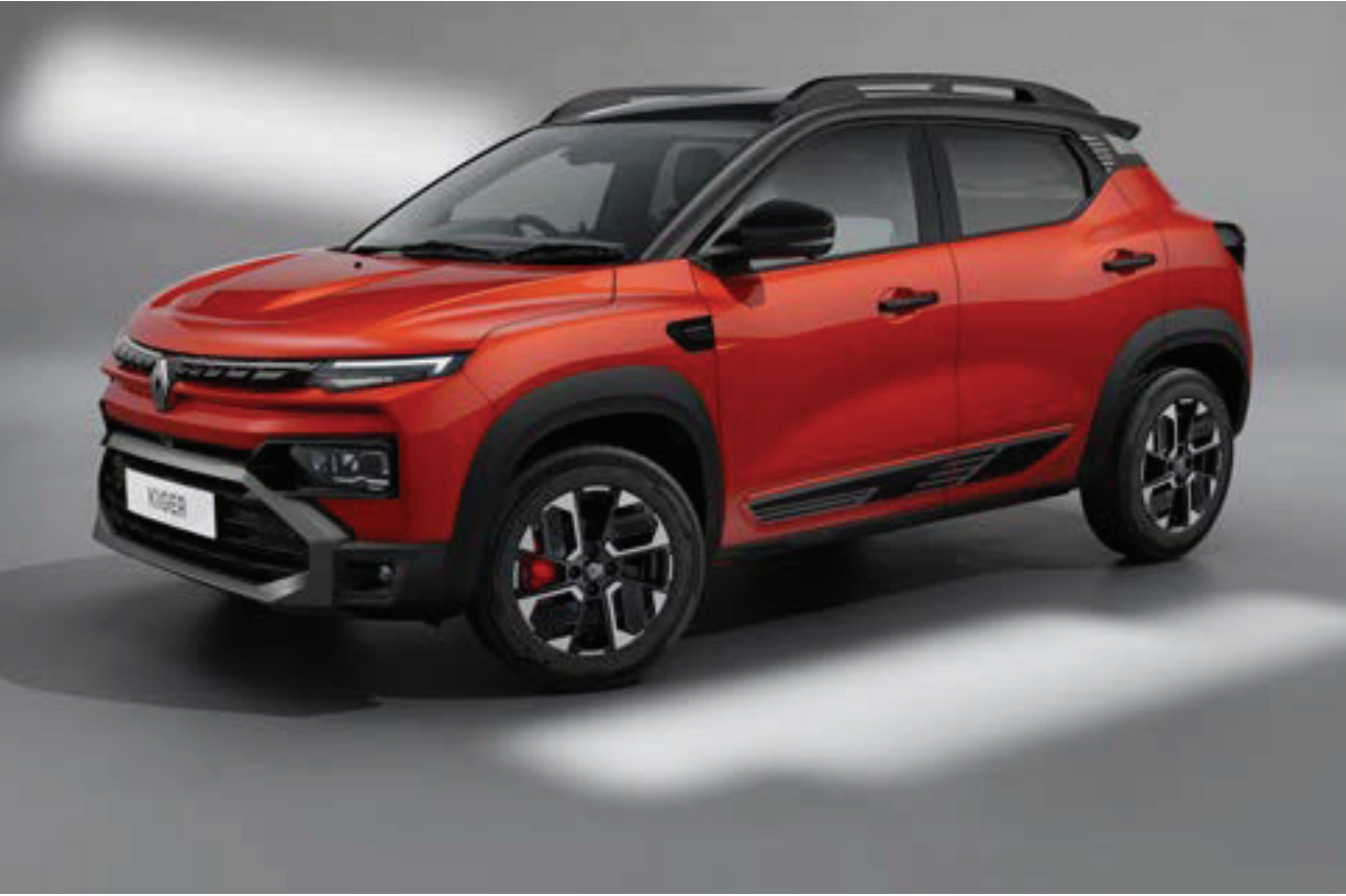
radiant red with mystery black roof