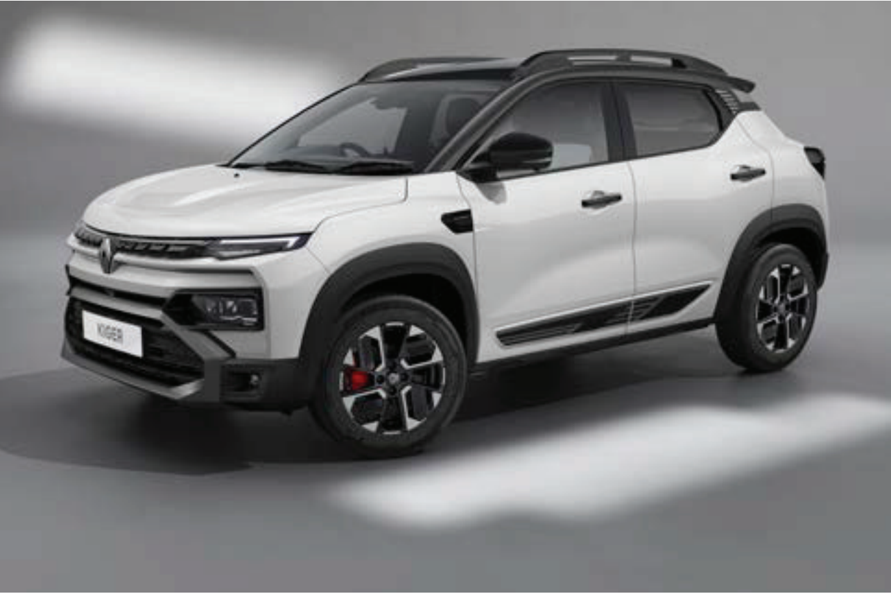
ice cool white with mystery black roof