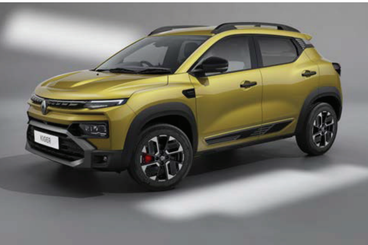
new oasis yellow