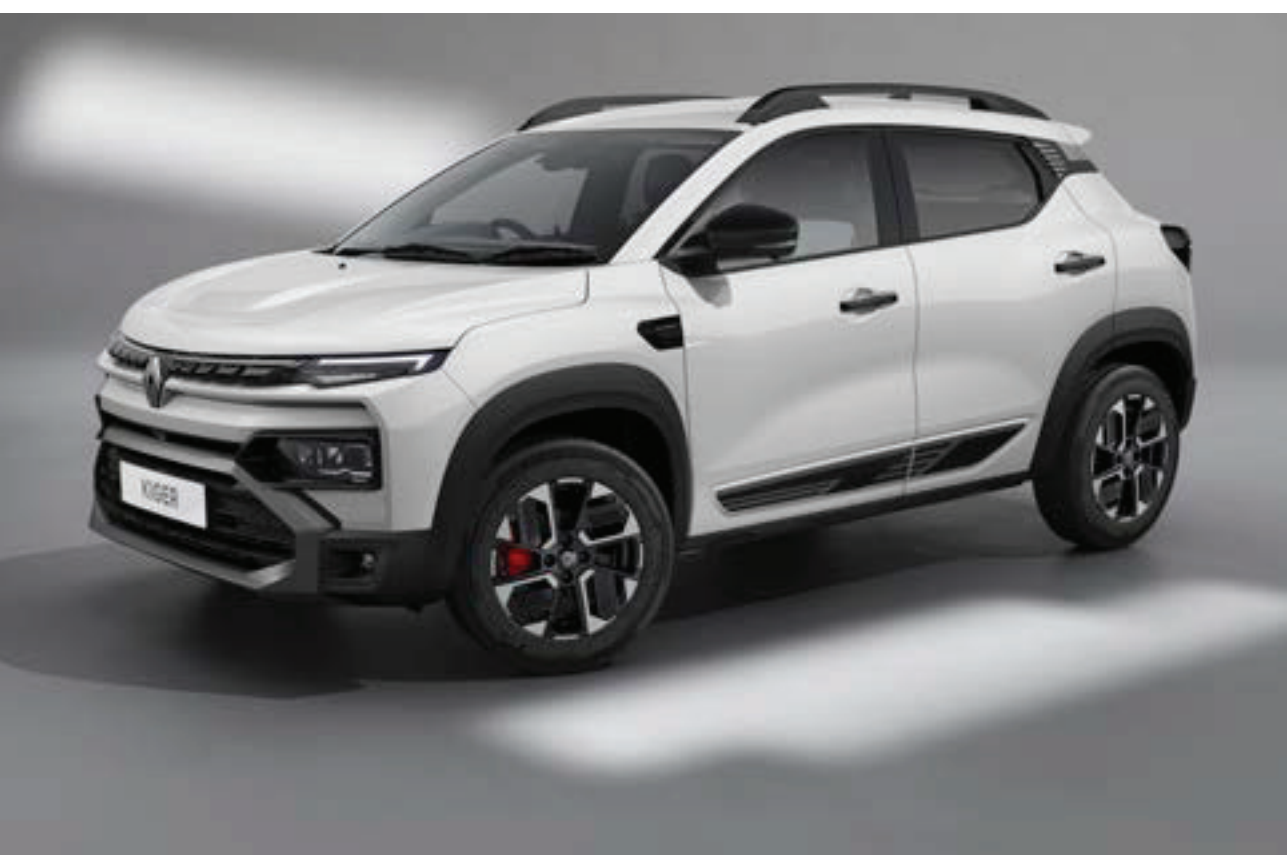
ice cool white